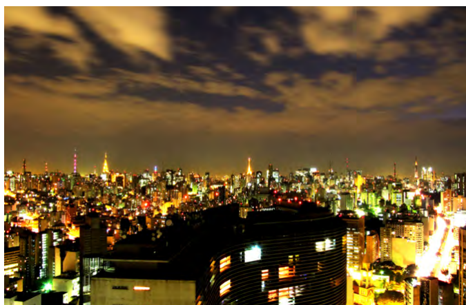
São Paulo – a city known for being continuous Congresses, trade fairs, conventions, international concerts